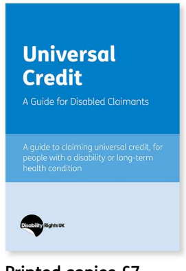
Printed copies £7 including postage

Public satisfaction with the NHS and social care in 2022: Results from the British Social Attitudes survey is available from kingsfund.org.uk.