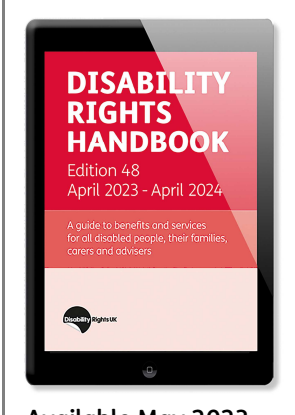
Available May 2023

Genuine NKS Radar Key: £5.00 inc P&P and VAT (if applicable). Available from our online shop